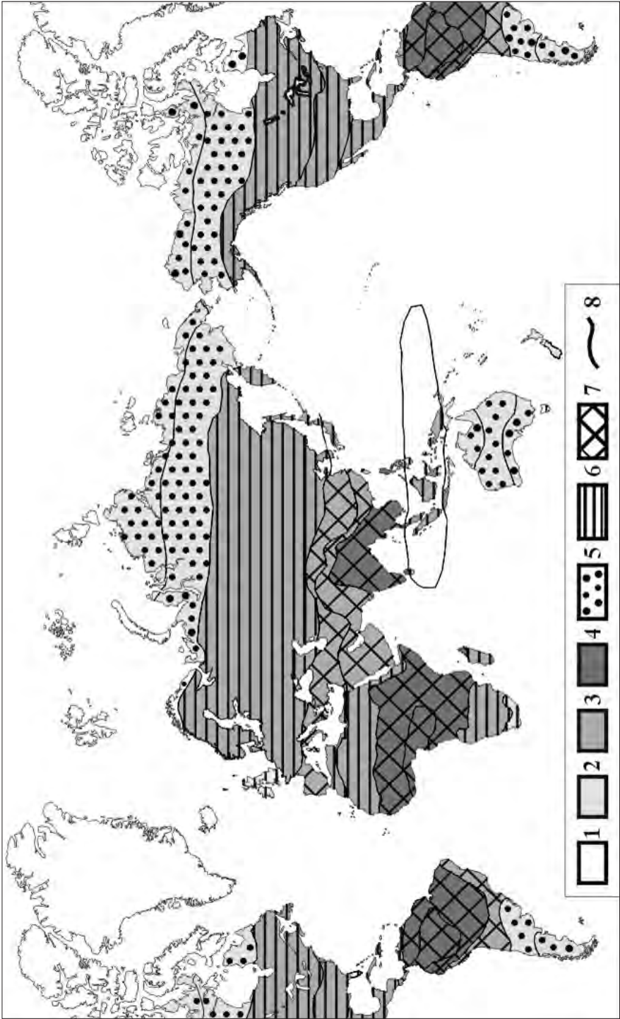
Fig. 1. Medical geographical assessment of world geographical belts (according to a complex of natural-endemic diseases).

Intensity of natural preconditions: 1 - absent, 2 - low, 3 - medium, 4 - high; diversity by the number of nosoforms: 5 - low, 6 - medium, 7 - high; 8 - borders of geographical belts