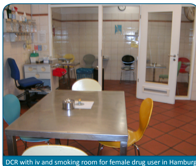
DCR with iv and smoking room for female drug user in Hamburg

use drugs. Various studies have shown that the proportion of women in DCRs varies between 10% and 25%. The particular barriers faced by women trying to enter mainstream DCRs are not well known. However, the experience of those DCRs that offer women-only services is that they can reach out more effectively to women who use drugs. Mixed gender DCRs are not as attractive for women who use drugs given the limited range of specialist services.