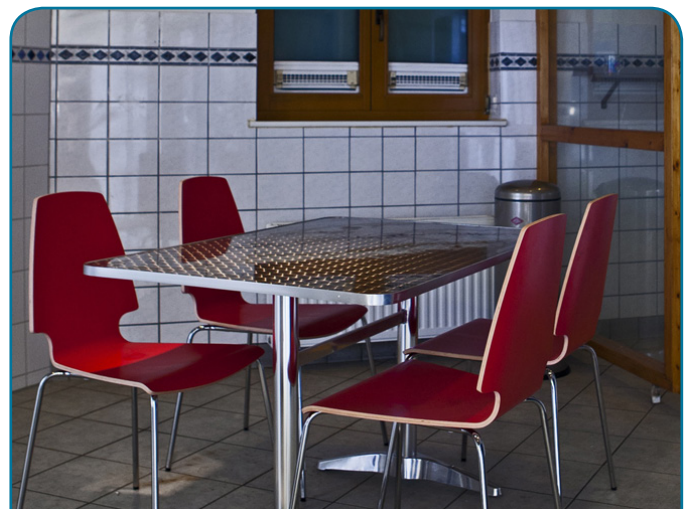
Inhaling drug allowed, SKYEN, Denmark