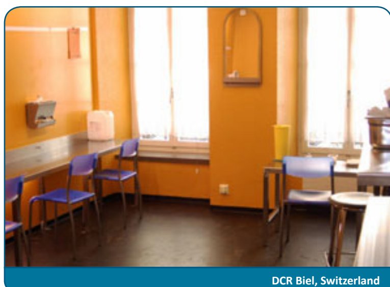
DCR Biel, Switzerland