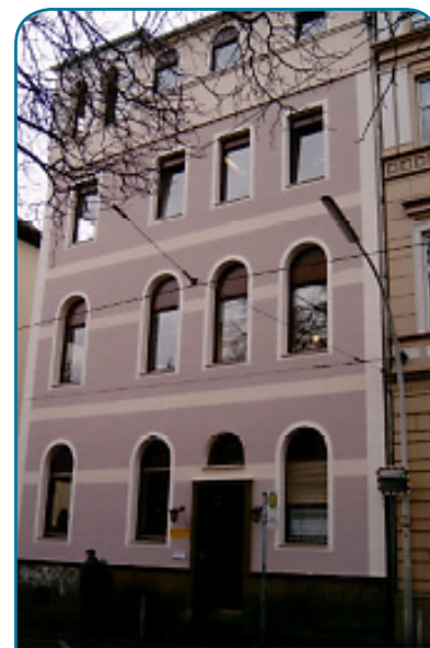
DCR Bonn, the integrated Model

Integrated facilities are the most common type. These DCRs are typically a part of a broader and interlinked network of services. Today DCRs are mostly based in drug service centres alongside a range of other services, such as counselling and testing for blood borne viruses, drop in centre (DIC) with needle and syringe programmes (NSP), psychosocial care, care for homeless people, medical services (e.g. wound care), and access to employment programmes. Usually the DCR is provided in a dedicated area of the service and the access is normally controlled by staff. This allows staff to limit the number of PWUD using the DCR at any one time and also to manage entry restrictions, most commonly to enforce a minimum age limit of 18 years and also to prevent those in opiate substitution treatment from entering the service (e.g. Germany).