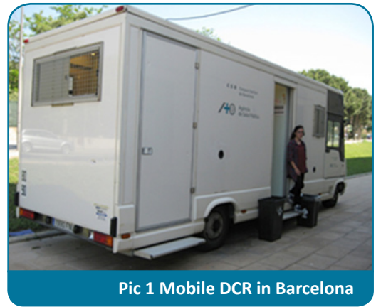
Pic 1 Mobile DCR in Barcelona

The mobile DCRs in Barcelona (Pics. 1 and 2) and Berlin are comprised of especially fitted-out vans that have three injection booths. While the van in Berlin does provide services in different locations, the Barcelona van is currently based in only one location, an industrial area that is a well-known location for the dealing, and use of illegal drugs.