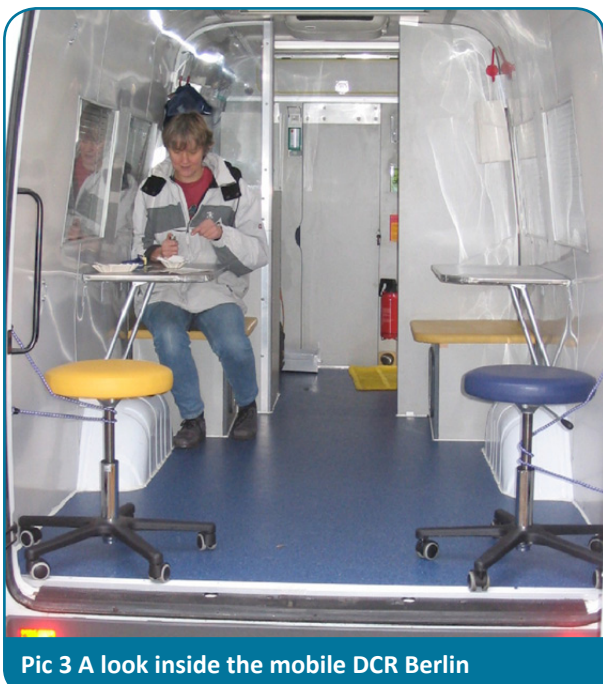
Pic 3 A look inside the mobile DCR Berlin

Clients of the mobile DCRs are registered after an initial assessment, which provides an opportunity for onward referral. Following registration there are no restrictions on access to the mobile DCR in Barcelona. However, in Berlin, PWID who are in opiate substitution treatment are not allowed to enter the mobile DCR. The general operating principles of the mobile DCR are consistent with fixed site DCRs. The major difference is throughput. With only 3 booths, mobile DCRs inevitably see less people per day than larger fixed-site services.