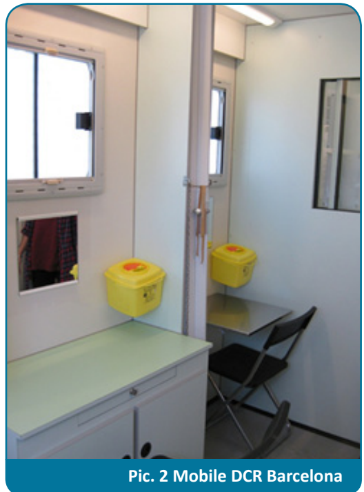
Pic. 2 Mobile DCR Barcelona