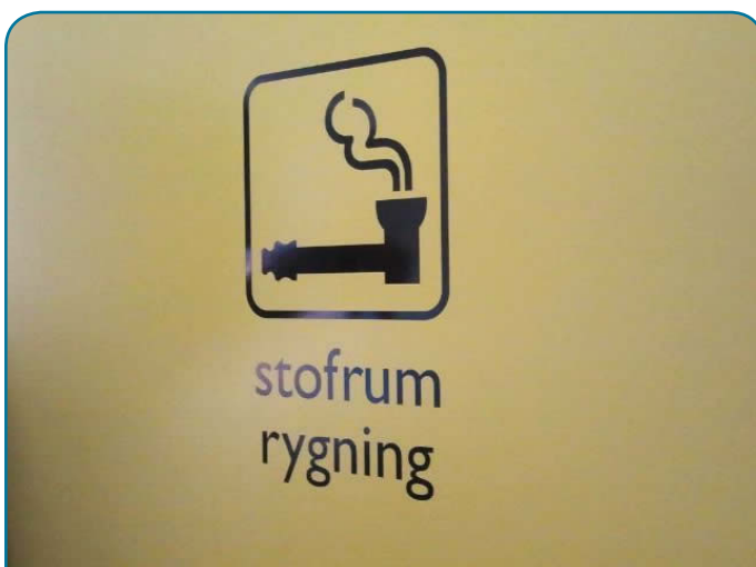
Inhaling drug allowed, SKYEN, Denmark