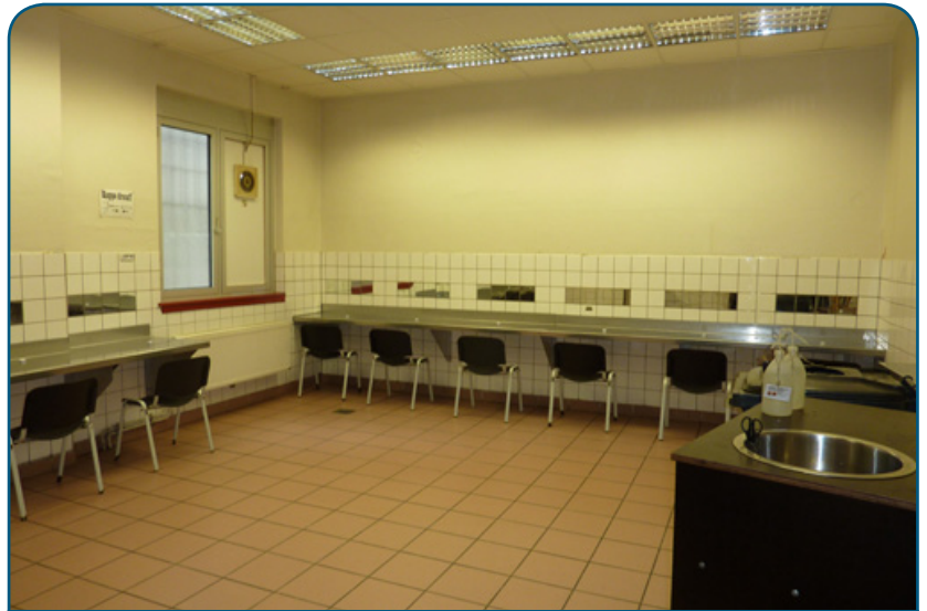
DCR Nidda 49 , Frankfurt

The drug consumption room in Frankfurt/Germany (Niddastr. 49) is an example of a specialised model. More than 100,000 drug consumption events have been supervised in 2012. The facility is located near the main railway station, in close vicinity to a range of other drugs services. It is part of a major non-governmental organisation that runs a range of other programmes, including a night shelter, counselling services, access to employment services, and a methadone maintenance treatment programme. The service follows a three-step admission procedure: