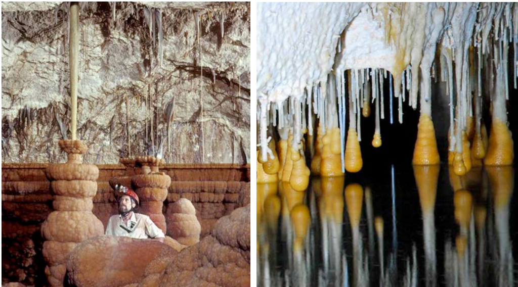
Figure 3. A (left): Multiple shelfstone levels in Lechuguilla Cave. B (right): Present-day phreatic overgrowths on speleothems in Cova des Pas de Vallgornera, Mallorca.

The timing of initiation and cessation of speleothems growth is relatively easy to resolve applying U/Th measurements on carbonate material extracted from the