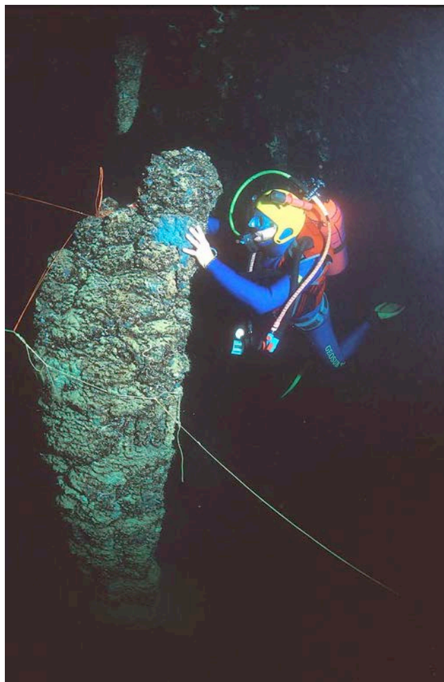
Figure 4. Submerged speleothem showing marine biogenic encrustations (Argentarola Cave, Italy).

bottom and top of a speleothem. The obtained ages will roughly indicate when the cave was air-filled and then invaded by seawater (Li et al. , 1989; Richards et al. , 1994). Nevertheless, the precise elevation of the sea level stand will remain unknown unless additional information (e.g., marine organisms that colonizes very narrow habitats below sea surface) becomes available. After a preliminary study published by Spalding & Mathews (1972) on a submerged stalagmite from Ben's Hole (Grand Bahama Island), the idea of using such speleothems in reconstructing Quaternary sea-levels made headlines in journals such as Science and Nature (Gascoyne et al. , 1979; Harmon et al. , 1981; Li et al. , 1989; Richards et al. , 1994).