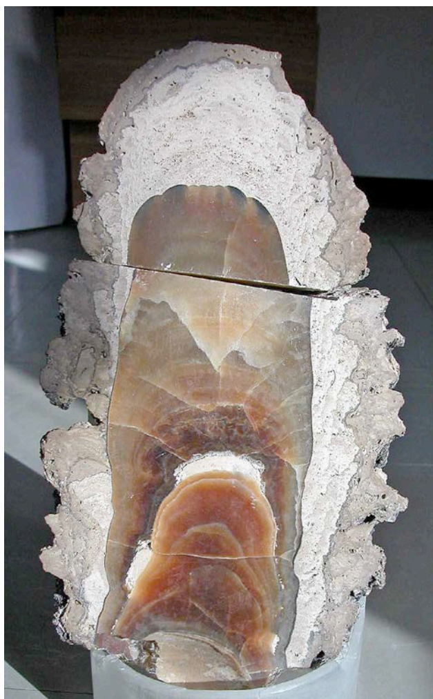
Figure 5. Speleothem ASI from Argentarola Cave (Italy). For details see the text.

To date, the most detailed studies on stalagmites that show sequences of sub-aerial precipitated calcite (i.e., times of low sea-level stands) and marine biogenic overgrowths (serpulid colonies; corresponding to periods of highstands) were carried out by Bard et al. (2002) and Antonioli et al. (2004). Their work is based on a number of speleothems recovered from Argentarola Cave (Italy) from depths between -3.5 and -21.7 m below present sea-level. Particularly important was stalagmite ASI (Figure 5), which displayed five marine and four terrestrial calcite layers that allowed the authors to generate the history of sea-level changes over the past 215-ka. From the very same cave, using two additional submerged speleothems, Dutton et al. (2009a) documented three sea-level highstands between 245 and 190 ka (MIS 7).