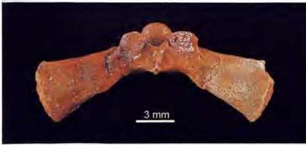
Fig. 2. Latonia sp. (CJQ uncataloged). Punta Nati 6. Sacral vertebra in dorsal view.