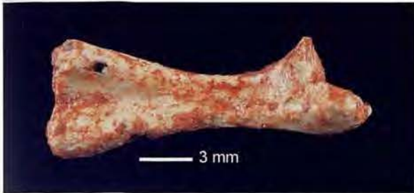
Fig. 3. Latonia sp. (CJQ 1339). Punta Nati 6. Right radioulna in lateral view.