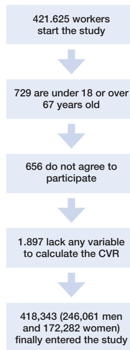
Figure 1: Flow chart.

To determine weight (in kg) and height (in cm), a SECA 700 scale with an attached SECA 220 telescopic measuring rod was used. Waist circumference (WC) was measured with a SECA measuring tape while the person was standing upright, with feet together, trunk straight and abdomen relaxed. The tape was placed parallel to the floor at the level of the last floating rib.