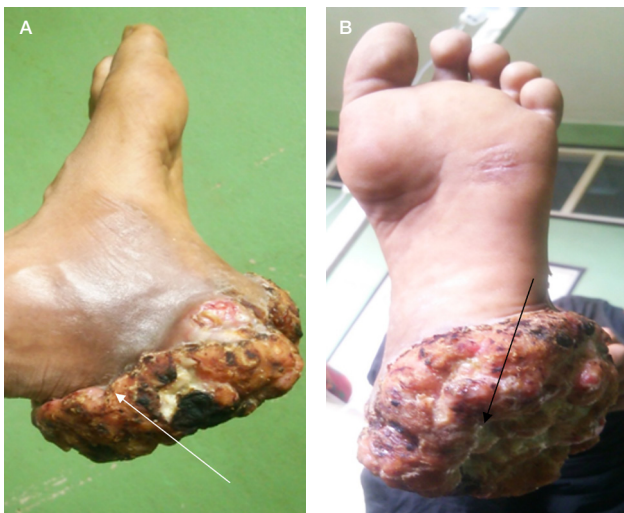
Figure 1: Ulcero-budding heel wound with central fissures and peripheral inflammation.