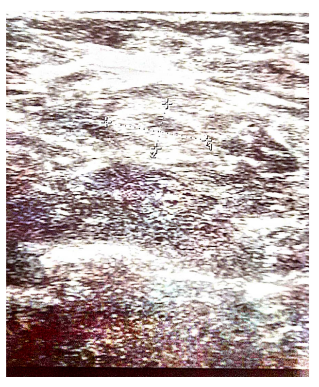
Figure 2: Intramammary lymph node, Ultrasound scan.

Of 1000 participants, 69 had intramammary lymph node, with the mean age of 50.3±1.29. The clinical