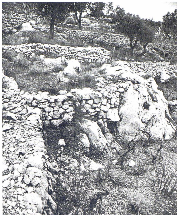
Photo 2. Side-walls and cultural terraces in the Adriatic island Lošinj, near to the town Mali Lošinj where in some plots more than 1.000 kg/m 2 of cut off and accumulated stones have been found.

Forms of the accumulated stones are different and typical of regions. Stones can form irregular heaps or elongated rows. Systematically so called dry walls or karst walls are built. If the pebbles are compounded of one serie, the width of wall is the same as the length of pebble. Larger are the walls with two series of pebbles. Some of them have the inner part between two series filled up by minor particles. The accumulations are seldom in form of quadrangular tower or pyramidal elevations. In the past centuries the stone accumulation has been in some places removed or concentrated in big formations to get more cultivated land. The stones cut off have also been used for buildings, roads, lime-kiln, they have also been thrown in the potholes, chasms etc. A part of them had been buried under the soil what was proved by bore-holes and excavations (Gams 1973, 1974, 1977). The buried pebbles have been found: a) In the lower belt of the so called cultural terraces. When constructing them on the inclined surface the rubble has been