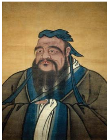
Confucius Cultural Week for Confucius

An International Jury appointed by UNESCO's Director-General meets in Paris once a year to recommend potential prizewinning programmes for the Director-General's decision. The Jury is made up of high profile practitioners and academics in the field of education, who are appointed for a period of two years. Candidatures for the prizes are submitted by Member States or by international non-governmental organizations in official partnership with UNESCO. The Jury is presently composed of six experts representing UNESCO's geographical distribution.