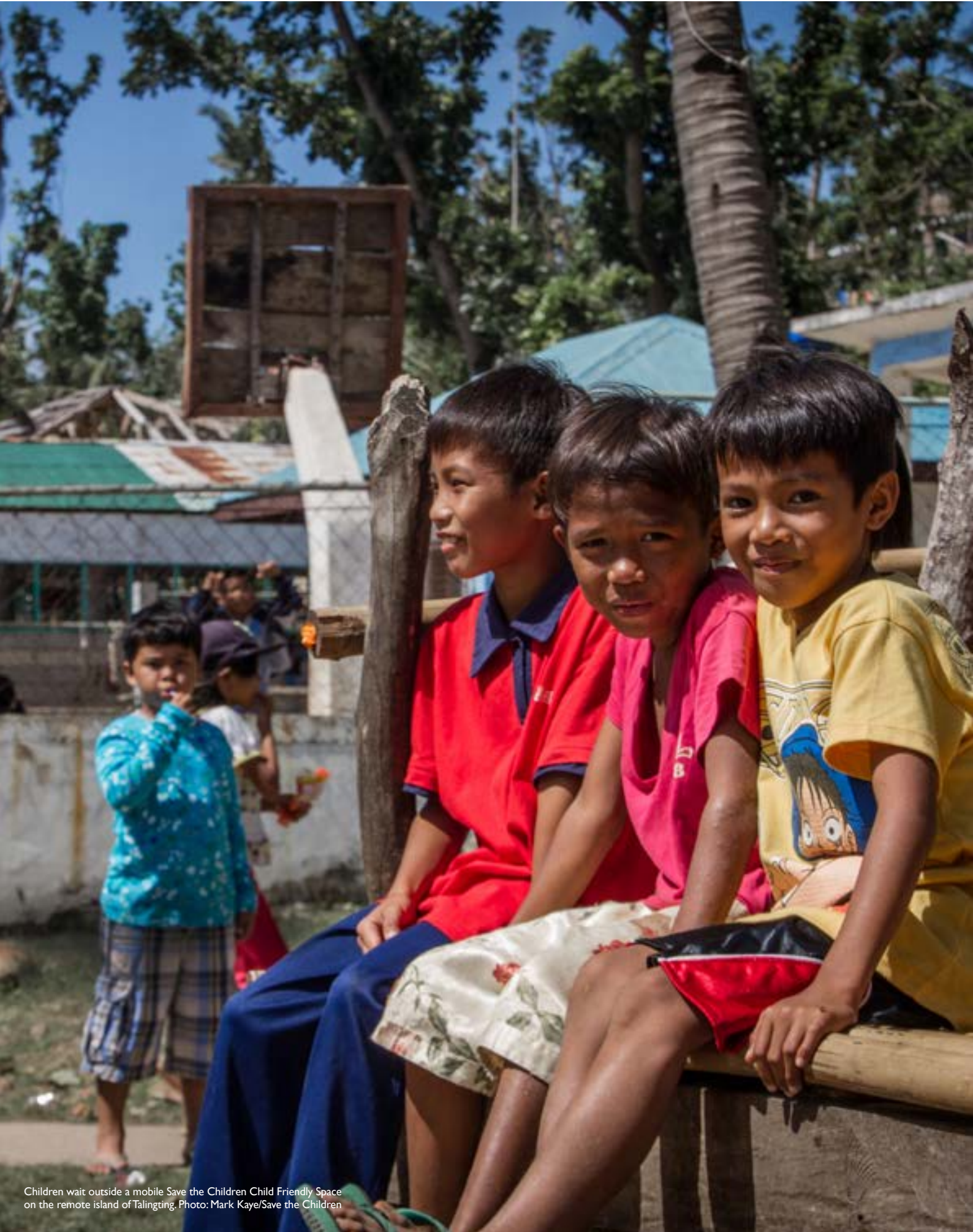
Children wait outside a mobile Save the Children Child Friendly Space on the remote island of Talingting.