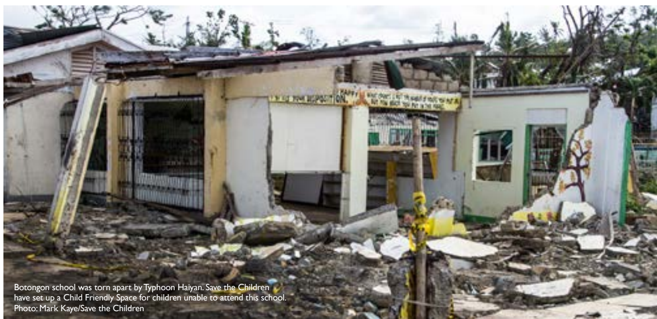
Botongon school was torn apart by Typhoon Haiyan. Save the Children have set up a Child Friendly Space for children unable to attend this school.