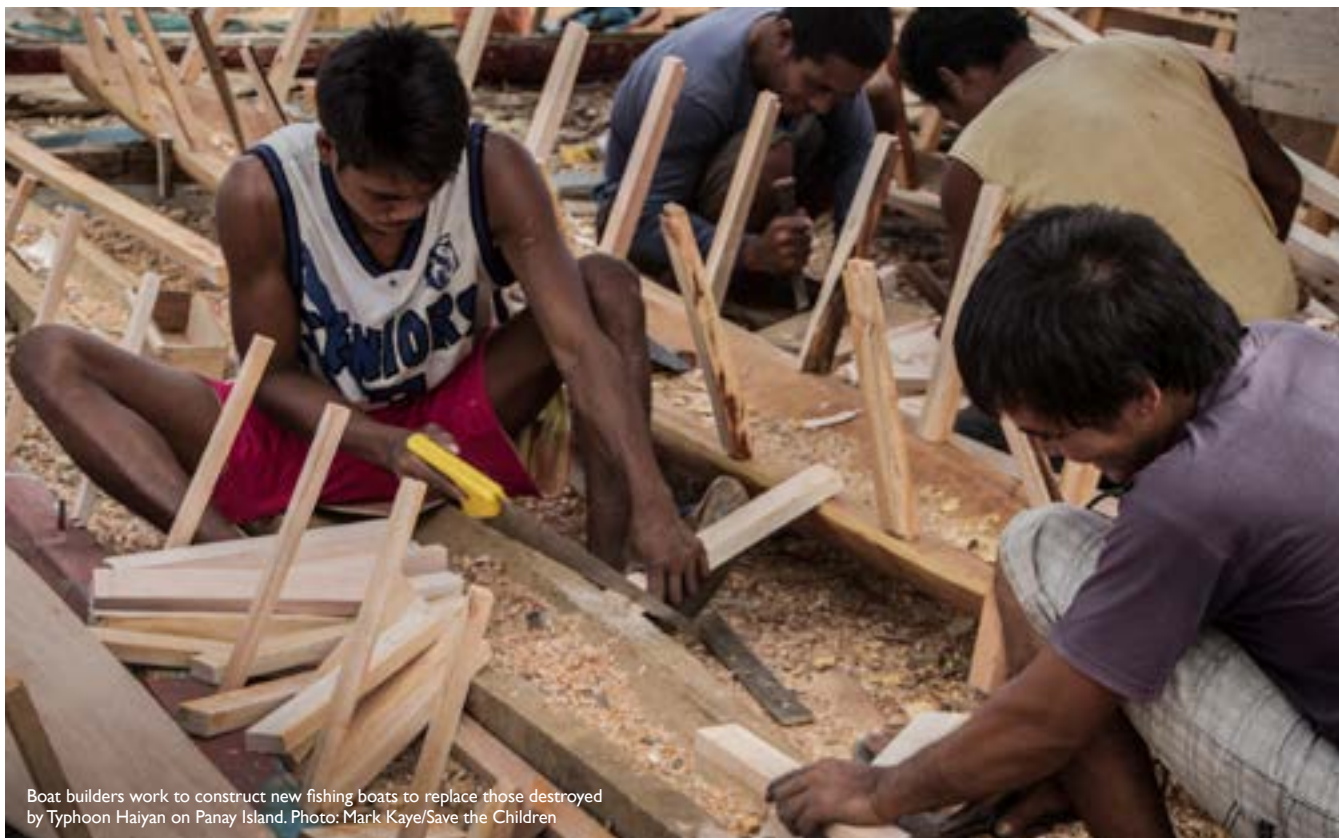
Boat builders work to construct new fishing boats to replace those destroyed by Typhoon Haiyan on Panay Island.