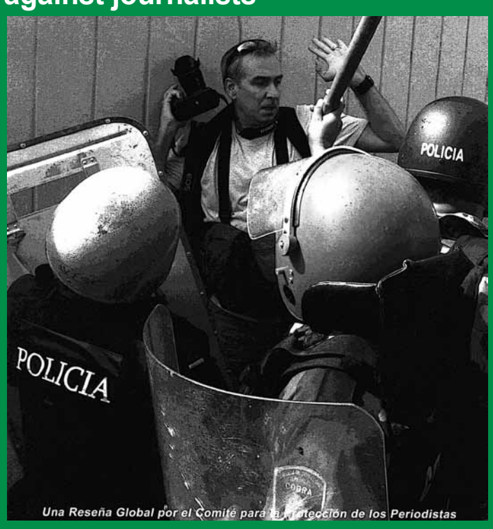
Portion of the cover of the recent report by the Committee for the Protection of Journalists (CPJ) on attacks against the press in 2009.

According to a recent report by the Foundation for Press Freedom (FLIP)<sup>6</sup>, threats continue to be the most common way to restrict the work of journalists and silence them. In 2009, there were 74 cases involving 97 victims<sup>7</sup>. According to FLIP, this only represents the tip of the iceberg since there is under-reporting. Threats have affected the freedom of press because according to the FLIP «many journalists prefer to stop reporting abuses and not touch on "dangerous" issues, especially information concerning corruption and investigations on the armed