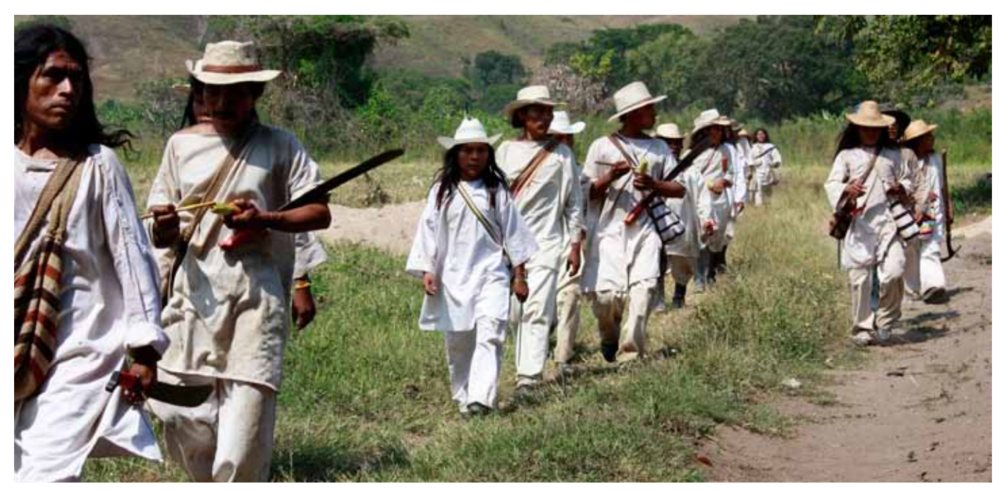
CCAJAR provides legal consultation to the Wiwa indigenous community.