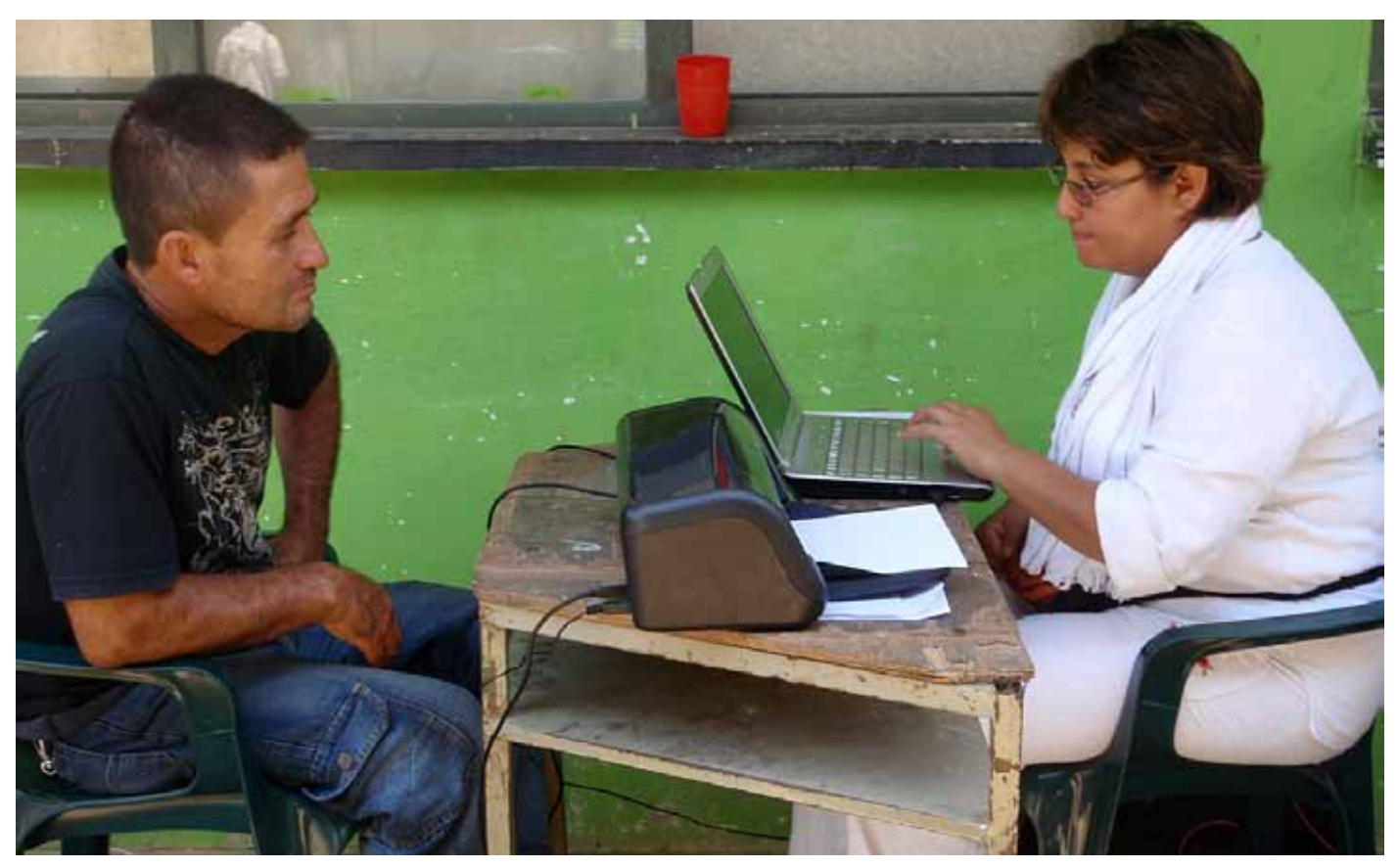
Gathering testimony for the «Report by the Extraordinary Verification Commission in Catatumbo» following massive detentions in February 2010. The commission consisted of national and international NGOs in Catatumbo.

The region of Catatumbo (Norte de Santander) has been one of the areas most affected by recent socio-political violence in Colombia. It is estimated that in this region at least five thousand people were murdered and 40 thousand have been the victims of forced displacement over the last ten years<sup>1</sup>. The latest grave incidents took place in February 2010 when 20 members of grassroots and human rights organisations were detained<sup>2</sup> under charges of terrorism, rebellion, and conspiracy to commit a crime<sup>3</sup>.