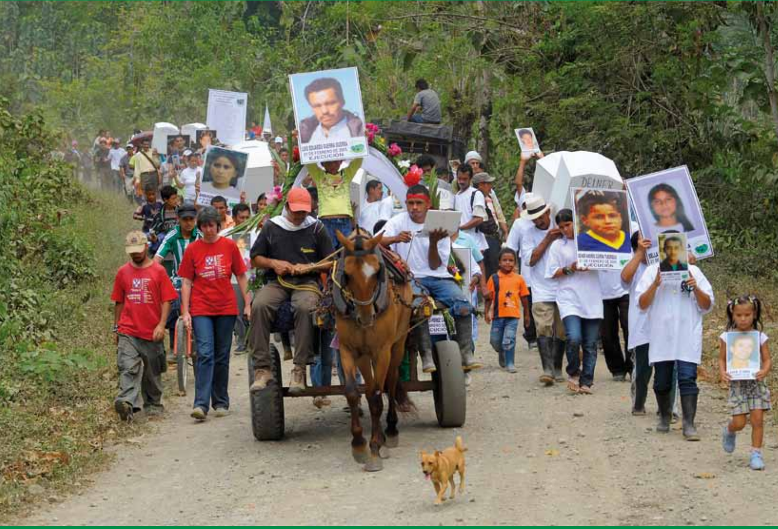
Walk Commemorating Five Years since the Massacre of San José de Apartadó in February 2005.

eace Brigades International (PBI) is a non-governmental organisation recognised by the United Nations, which has maintained a team of international observers/accompaniers in Colombia on an ongoing basis since 1994. PBI's mission is to protect the working environment of human rights defenders, who face repression due to their non-violent human rights activities.