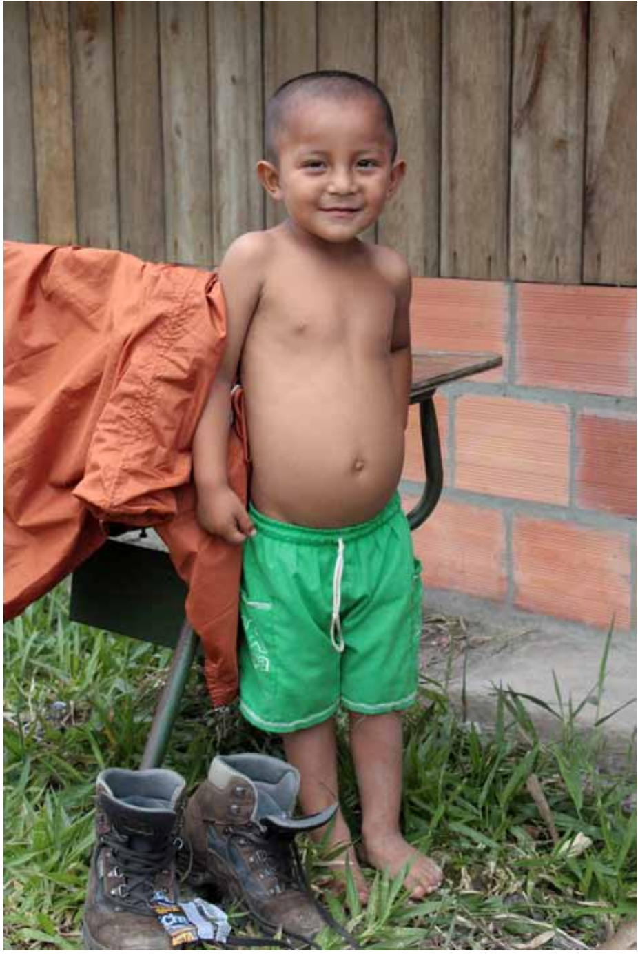
Child from the Uwa indigenous community in Casanare.

114 murders, although at the end of 2009 the Association of Indigenous Councils of Northern Cauca informed us of another 62 murders. We are very concerned because this figure almost doubled in comparison with 2008 and demonstrates that the situation of indigenous peoples in Colombia has continually worsened. If one compares the situation of indigenous peoples with that of other social sectors in the country, the human rights of indigenous peoples —in this case the right to life and territory— continue to be the most violated.