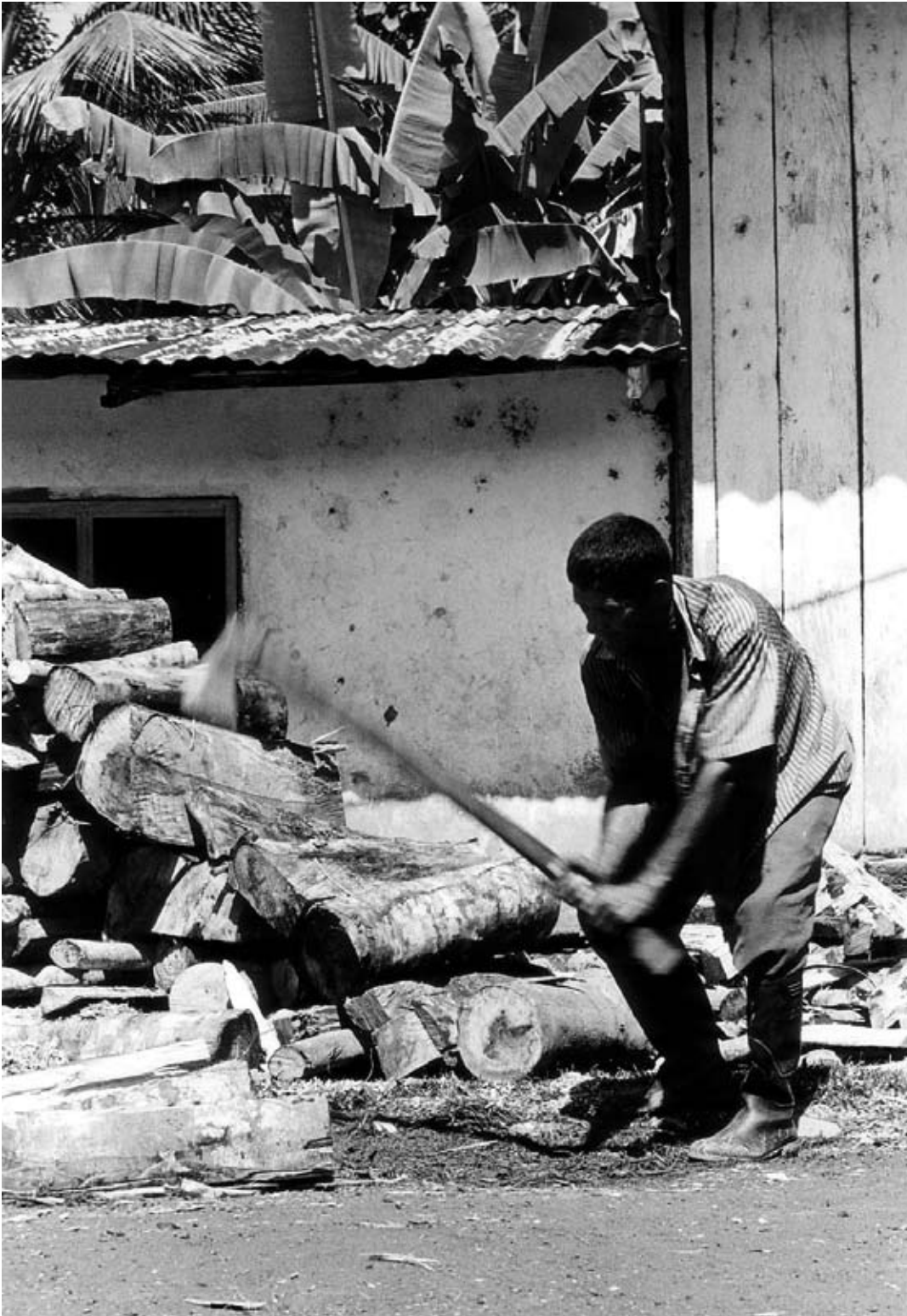
A peasant chopping wood in San José de Apartadó.

«These twelve years have been a hope built on solid bases, on real and alternative life projects that have been obstructed by the terror of the murderers. This is why the memory of 185 people from our community murdered is kept more alive than ever because we all believe in justice. These 12 years have allowed us to re-assert ourselves against impunity so that justice may be brought about for more than 750 human rights violations that have been committed against our [community], we are a clear example of the annihilation that has been committed, and continues against civil resistance communities in our country. Despite all these actions of terror, lies, legal processes, deaths, rapes, destruction of harvests, and threats, we have high hope because they are not twelve years of solitude. They are twelve years of the human warmth of many people who believe in a new humanity. We have not been left alone; on the contrary, [these people] walk day by day with us» 12 . ●