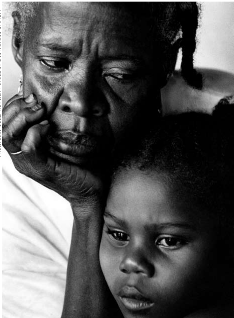
The faces of the returning, the anxious faces of a grandmother and granddaughter, moments before their arrival at Bellavista, Chocó.