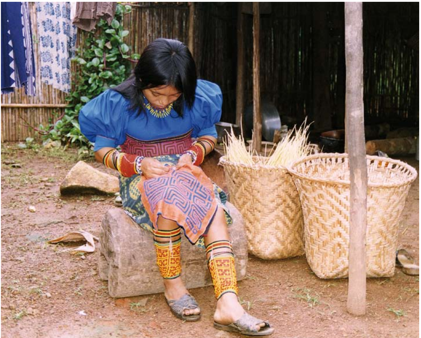
Colombia Images and Realities: Kuna indigenous woman in Arquíá.