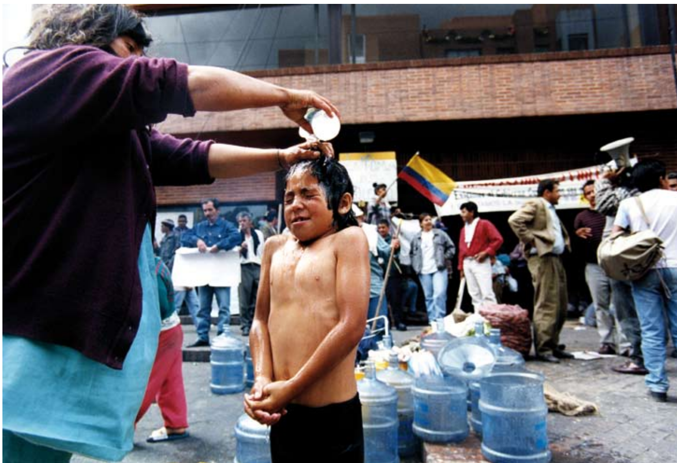
Displaced families in Bogotá.

The consequences of internal displacement are multiple. Social, family and community networks are broken down as communities are torn apart by conflict. The majority of those displaced in Colombia's violent conflict move to urban areas. Many live in the cinturones de miseria (poverty belts) of urban centres in overcrowded and dangerous living conditions. Unemployment levels for this sector of society are more than the national average, whilst those who do work do so under precarious conditions, with the majority of those displaced working in the informal sector.