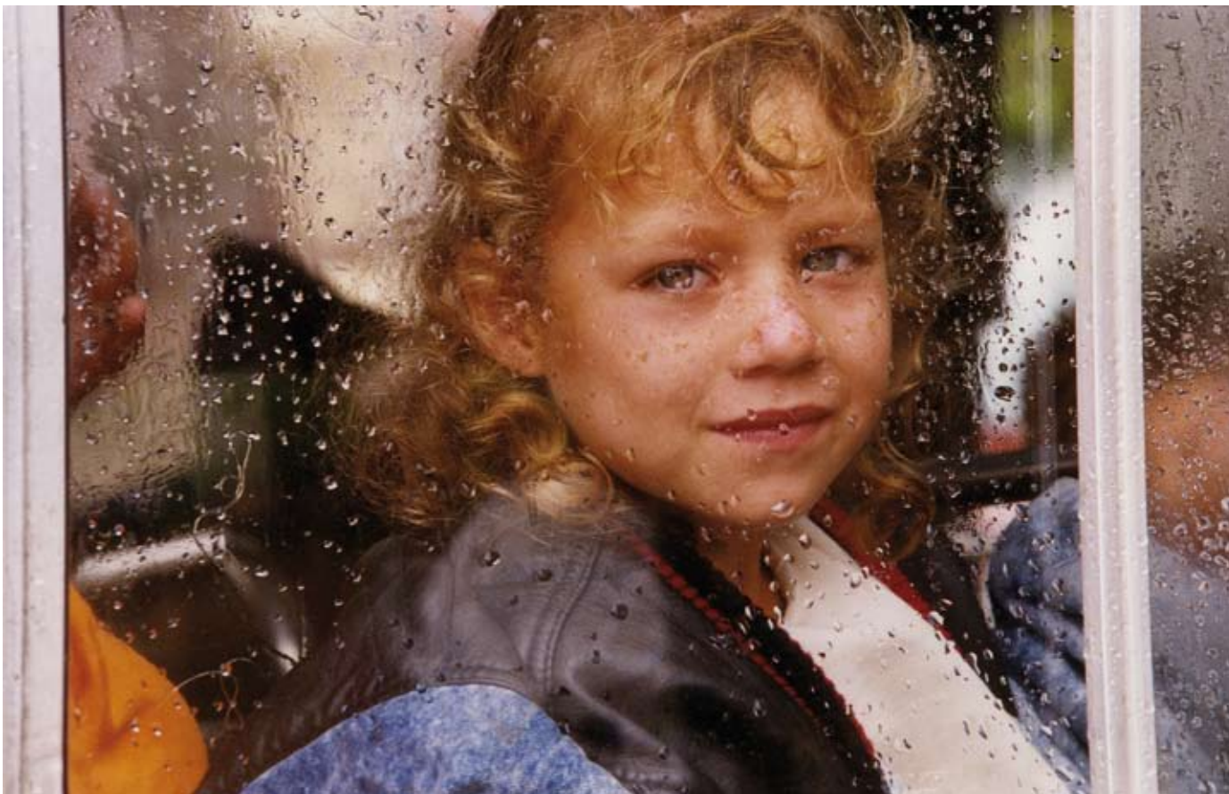
The return of displaced families.

as a war crime. Many women are also abandoned after the family is displaced.