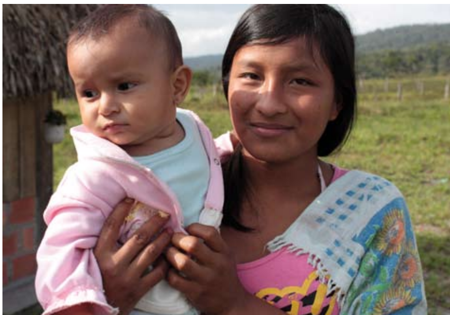
Uwa family from Casanare. The Uwa have worked with the organisation COS-PACC to develop strategies to prevent displacement in this department. 1.208 indigenous Uwa were victims of forced displacement between 2002 and 2009 3 .

AO: It is fundamental to comply with Resolution 004 of 2009. With respect to internal displacement, this means differentiated assistance is taken into account in prevention, fulfilment, implementation and economic support for the development of life plans for indigenous peoples. We believe that indigenous territories have to be completely demilitarised. If all the armed groups leave our territories, we will be able to live in peace. We also want them to make our territories whole, that is, for there not to be any settlers remaining in our territories. On many occasions, these settlers grow crops used for illicit purposes in our territories and as a result there is fumigation and the presence of armed groups. ●