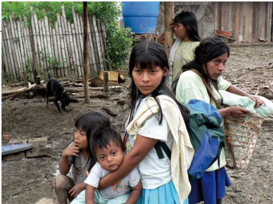
Massive forced displacement of the Awá indigenous community in the region of Inda Sabaleta, Nariño. In recent years this department has been the part of Colombia most affected by the armed conflict and forced displacement. 9.652 indigenous Awá were displaced between 2002 and 2009 2 .