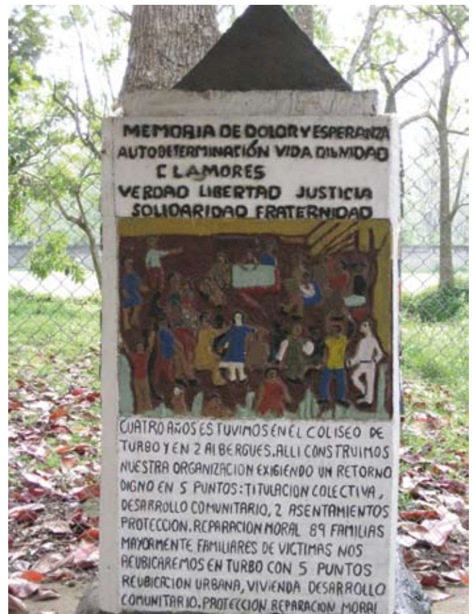
Prayers for life in Cacarica.