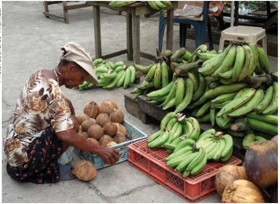
A Nariño woman.