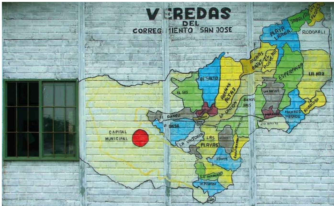
Villages in San José de Apartadó.

that there is now more awareness in the community that women can take on leadership roles. «The war has made us unite much more. [...] The war has been our "class-room". Because of our experiences we have become more conscious of our rights. We have had to learn how to treat others better too [...] about the importance of dialogue. We are more united now. We feel like we are human beings. We have rights and values. [...] We have learnt to demand our rights».