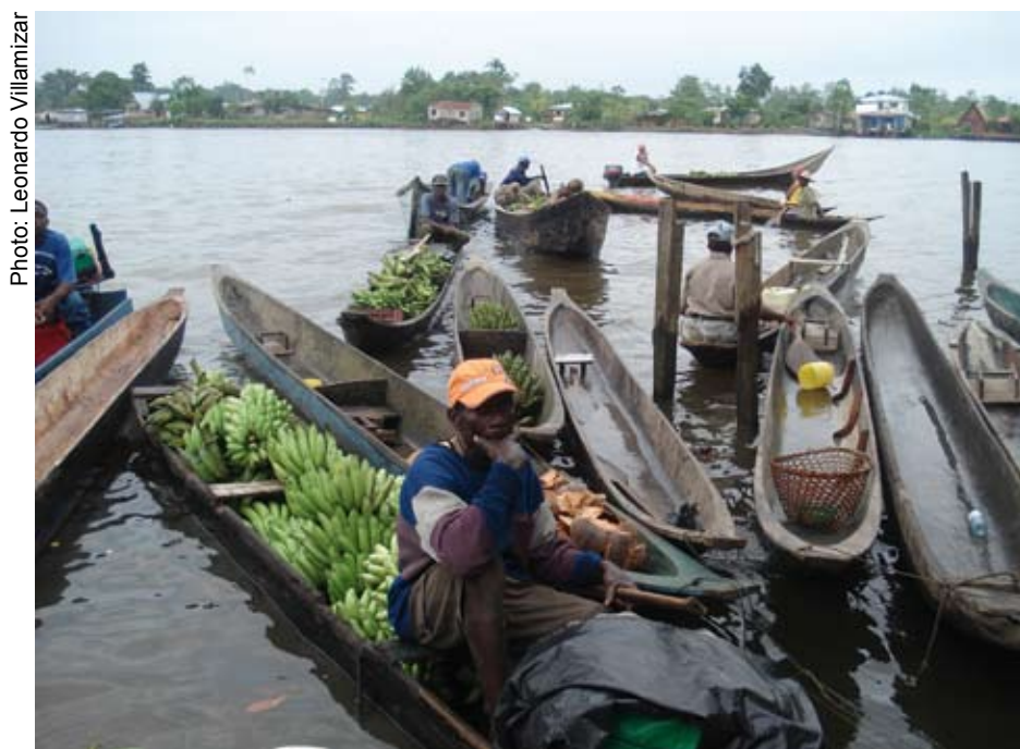
A small-scale farmer from Nariño.

PBI: As for prevention, do you think that the early warning systems are functioning well?