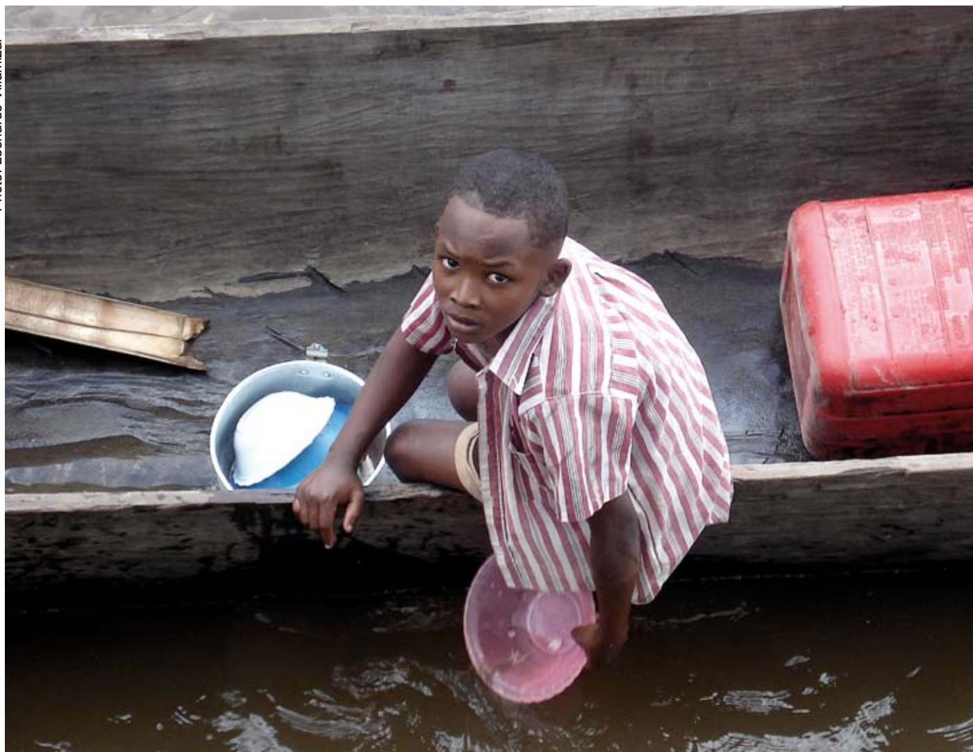
A youth from the Nariño department, a region with a high risk of forced displacement.

«Memory is our resistance. Many people came and told us that we should remain silent [...] then as we decided not to, despite the fear that surrounds us, we preferred to talk. We have talked, as a way of beginning to hope for the possibility of