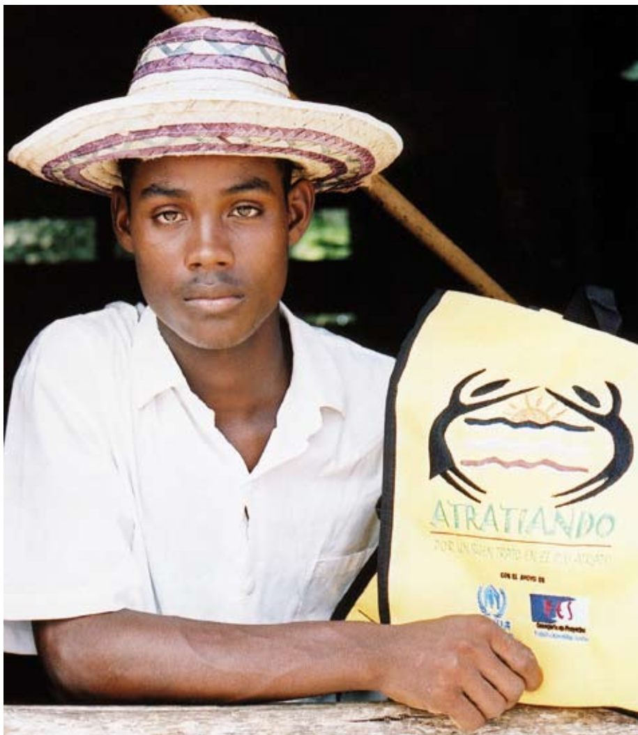
The campaign «Pilgrimage for Life and Peace along the Atrato River» launched in 2003. This is an initiative of local, national, and international organizations to highlight the humanitarian situation in the Chocó.

JNW: The issue of documentation. We recognise, thank and value the generosity of the neighbouring countries receiving Colombians in need of international protection. A lot of work still has to be done to document these cases and ensure we go from an informal to a formal protection. UNHCR colleagues in the neighbouring countries are working on this with the respective authorities in each country. ●