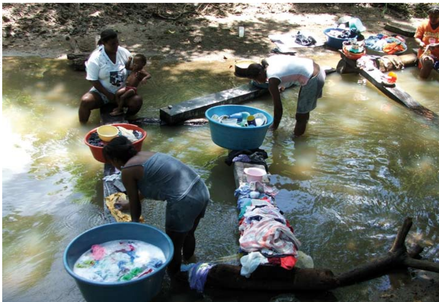
Women washing clothes on the riverbank, Cacarica.