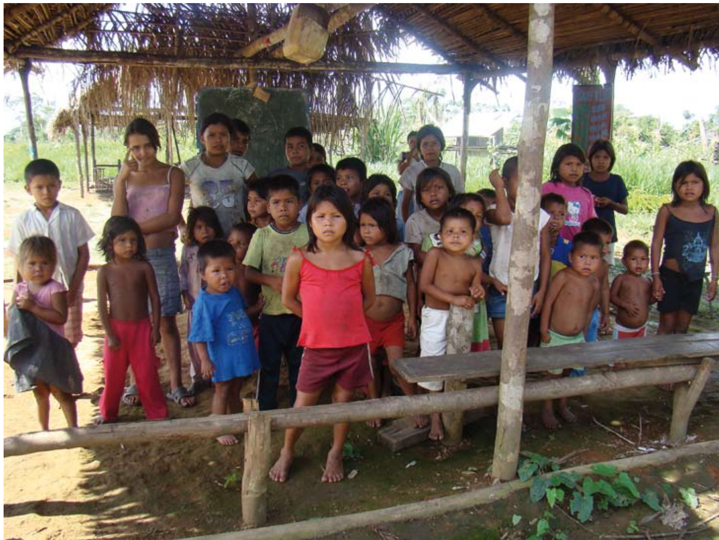
Indigenous children in the school in Bocas de Yi, a community drastically affected by forced recruitment of children.

This remote region of Vaupés has a total area of 50.000 square kilometres of rivers and jungle. There are only 16 kilometres of paved road surrounding the small city of Mitú, which is connected to the capital of the country, Bogotá, by only two flights a week. The Vaupés River is the only other means of transportation to the outside world.