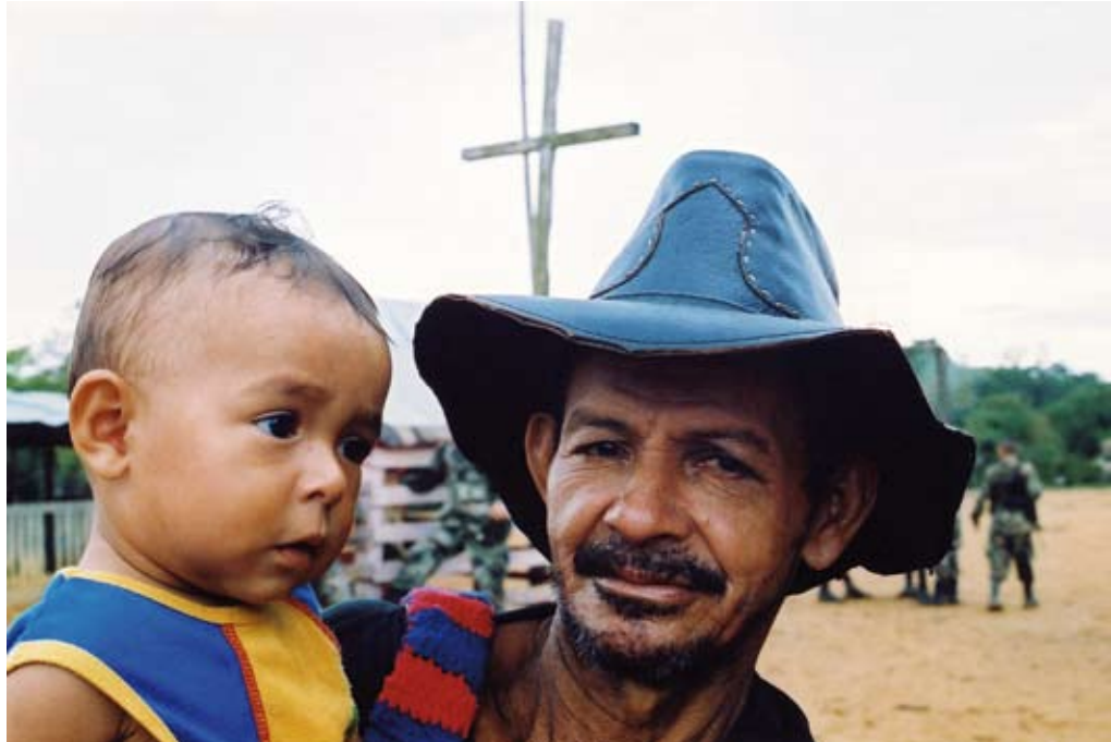
«Between 1997 and 2007 Antioquia was the department with the highest expulsion of population in the country» 2 .

As a volunteer from Germany, he states that he is motivated by seeing how human rights organisations support communities, in a way that goes beyond immediate humanitarian assistance to include a vision of hope for building a future for the region, bringing hope under difficult circumstances such as those faced by Angelópolis.