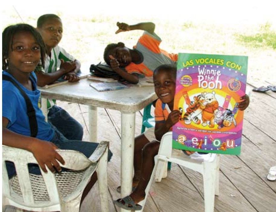
Learning letters in Cacarica.