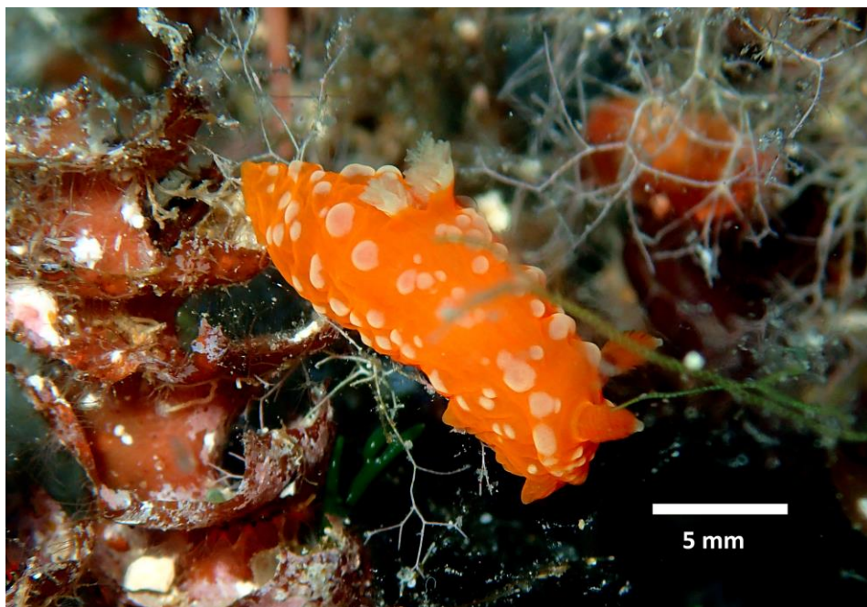
Fig. 1. Martadoris mediterranea crawling over Osmundaria volubilis at 35 meters depth.

Fig. 1. Martadoris mediterranea reptant sobre Osmundaria volubilis a la fondària de 35 metres.