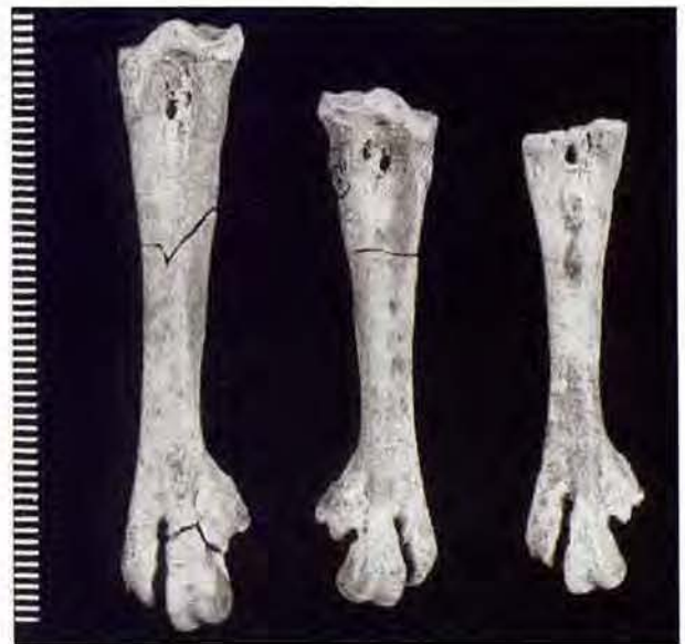
Fig. 2. Immature tarsometarsi of Melanitta fusca (left - 'Gor 1996, sample 276') and Melanitta nigra (centre - 'Gor 1996, sample 92' [proximal] and 'Gor 1995, sample 293' [distal]; right - 'Gor 1996, sample 5') from Gorham's Cave, Gibraltar.

Southerly displacement of these and other 'cold' marine species reflects regular extensions of Boreal water masses, at least in colder months, into the latitude of the Strait region, and possibly even into the western Mediterranean. Arguably, certain of these specimens may well record the impact of Heinrich Events on the avifaunas of the North Atlantic. At least four of these ice-rafting episodes are known to have occurred during the accumulation of the deposits in Gorham's and Vanguard Caves (Roucoux et al. , 2001). Part of the stratified immature specimen of Melanitta nigra was recovered from the unit underlying the base of the high-diversity unit dated by AMS radiocarbon to 51,700 \pm 3,300 BP (Cooper, 1999; Pettit & Bailey, 2000). This may suggest a correlation with a Heinrich Event at approximately 57,000BP (Roucoux et al. , 2001) but further analysis is required.