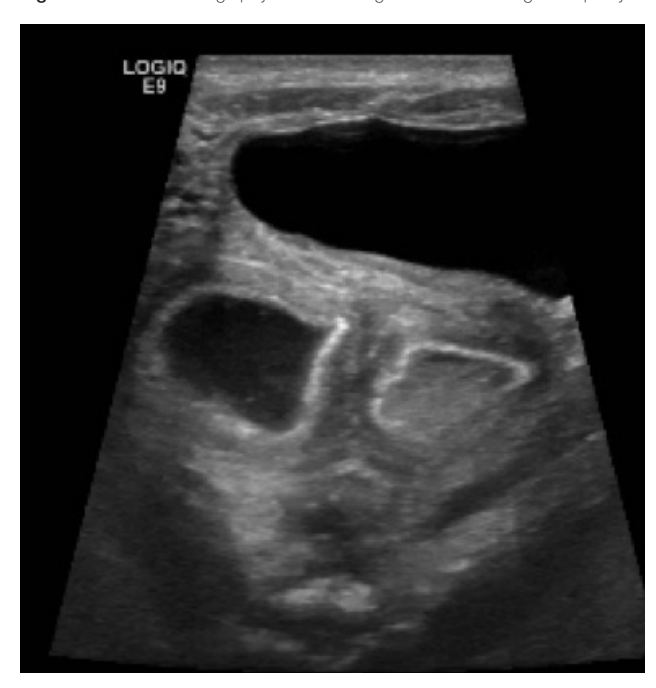
Figure 4: Postnatal sonography demonstrating an uterine and vaginal duplicity.

On the second day of life, a laparotomy was performed due to the suspicion of a cloacal malformation with fibroadhesive meconial peritonitis. During surgery, there was evidence of intestinal perforation and massive hydrosalpingometrocolpos that was decompressed by colpostomy (possibly meconial peritonitis was due to meconium refluxing the genitourinary system). The progressive instability of the patient forced closure (no tension with colostomy).