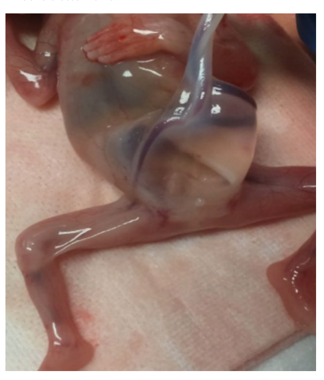
Figure 2: The fetus images once he was delivered. We can observe the defect in the anterior abdominal wall.

The sonographic suspicion was of a cloacal exstrophy, multidisciplinary approach was performed to advise the patient and she decided to terminate the pregnancy. When she delivered the fetus the defect of the anterior wall was observed ( Figure 2 ). The fetus and placenta were referred for anatomopathological study and the diagnosis was confirmed.