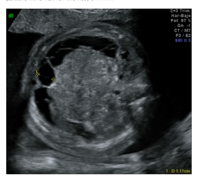
Figure 3: 30 weeks sonography demonstrated ascites with presentation of partitions with a maximum thickness of 11mm.

After evidencing deep spontaneous decelerations and a decrease in the variability in the cardiotocographic registry, an urgent caesarean section was indicated, delivering a live girl, Apgar 6/8 that required an admission into Neonatal Intensive Care Unit.