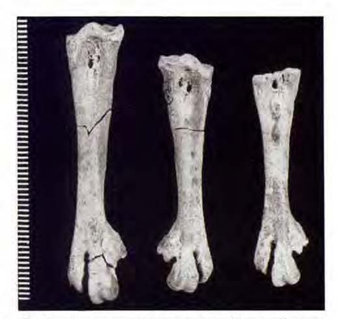
Fig. 2. Immature tarsometarsi of Melanitta fusca (left - 'Gor 1996, sample 276') and Melanitta nigra (centre - 'Gor 1996, sample 92' |proximal] and 'Gor 1995, sample 293' |distal]; right - 'Gor 1996, sample 5') from Gorham's Cave, Gibraltar.

Southerly displacement of these and other 'cold' marine species reflects regular extensions of Boreal water masses, at least in colder months, into the latitude of the Strait region, and possibly even into the western Mediterranean. Arguably, certain of these specimens may well record the impact of Heinrich Events on the avifaunas of the North Atlantic. At least four of these icerafting episodes are known to have occurred during the accumulation of the deposits in Gorham's and Vanguard Caves (Roucoux et al., 2001). Part of the stratified immature specimen of Melanitta nigra was recovered from the unit underlying the base of the high-diversity unit dated by AMS radiocarbon to 51,700 ± 3,300BP (Cooper, 1999; Pettit & Bailey, 2000). This may suggest a correlation with a Heinrich Event at approximately 57,000BP (Roucoux et al., 2001) but further analysis is required.