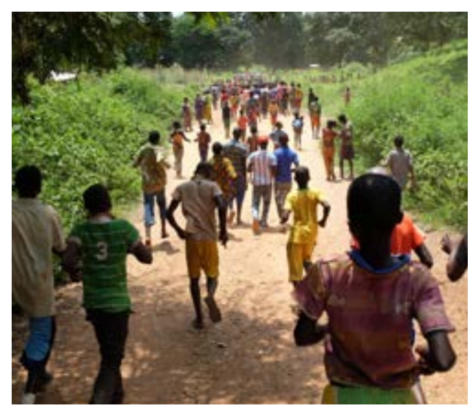
Some of the 163 children released by the militia run to the transit centre in Batangafo, Central African Republic. UNICEF helped facilitate the handover.

In 2014 and 2015, grave violations against children in situations of armed conflict have increased<sup>17</sup> – with children targeted for killing, maiming, torture, abduction, sexual violence and exploitation, as well as underage recruitment and use in armed conflict. Schools and hospitals and related personnel have been attacked and threatened, and humanitarian access has been denied.